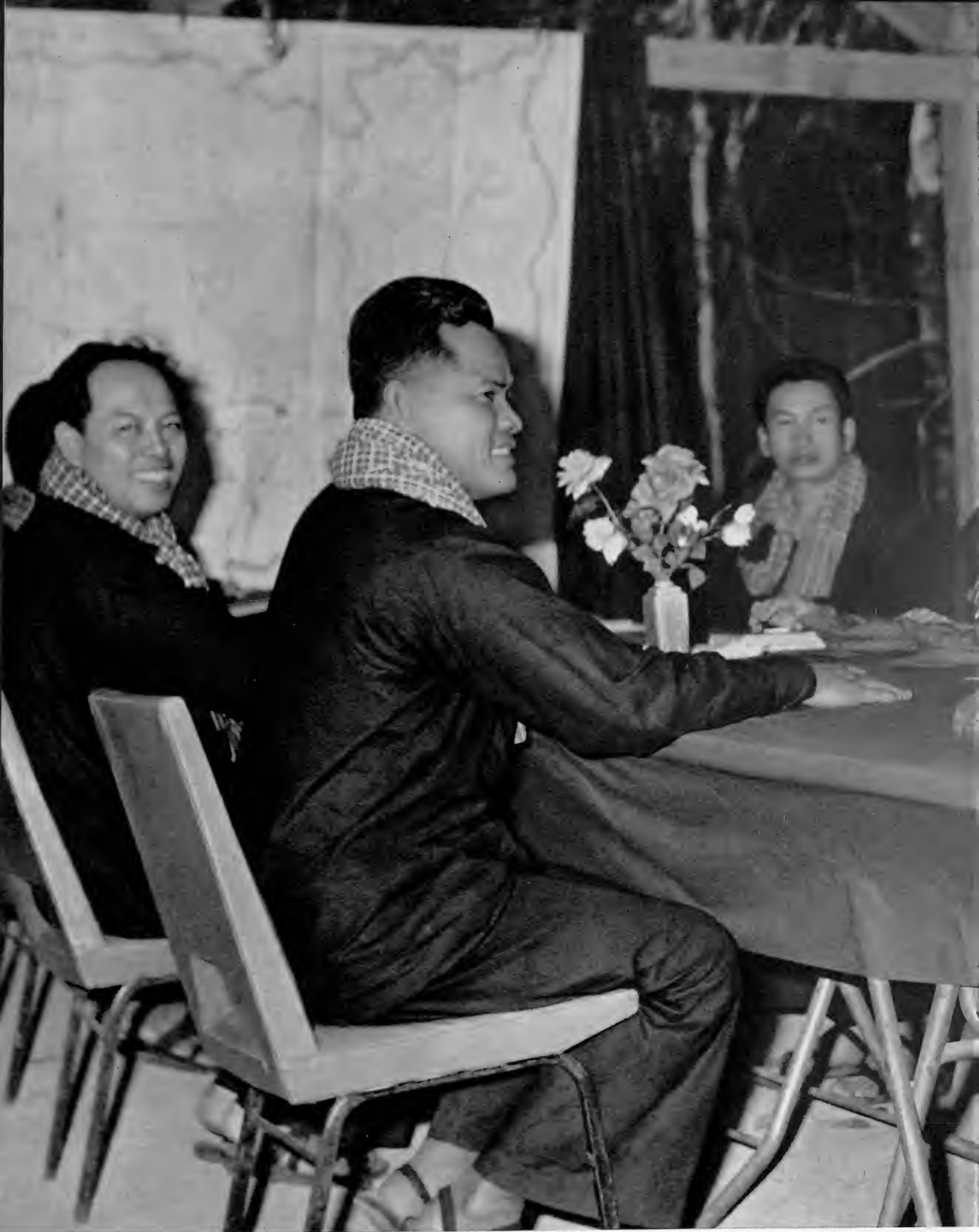
A historic event: The Head of State presides over the first meeting of the Council of Ministers of the Royal Government of National Union of Cambodia in the Liberated Zone. The Angkor forest served as cover for the meeting.